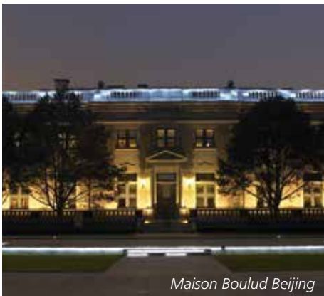
Maison Boulud Beijing

At 18:30 please join our hosts at the Beijing Quanjude Roast Duck Restaurant for dinner. Dress code: Smart casual