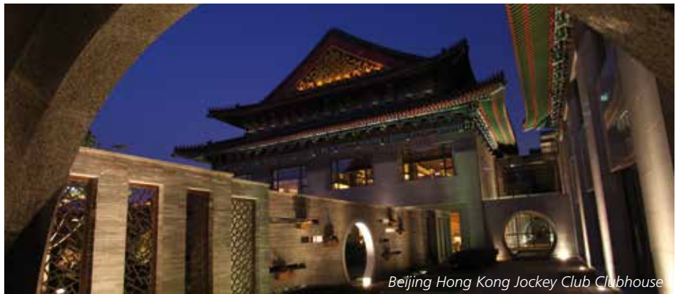
Beijing Hong Kong Jockey Club Clubhouse

Please note that pre-registration to all social events was required. If your plans have changed, kindly notify the registration desk at your earliest convenience.